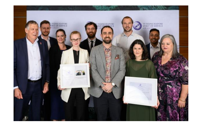
2023 Spirit of Service Award for Better cyber security outcomes through partnership with industry